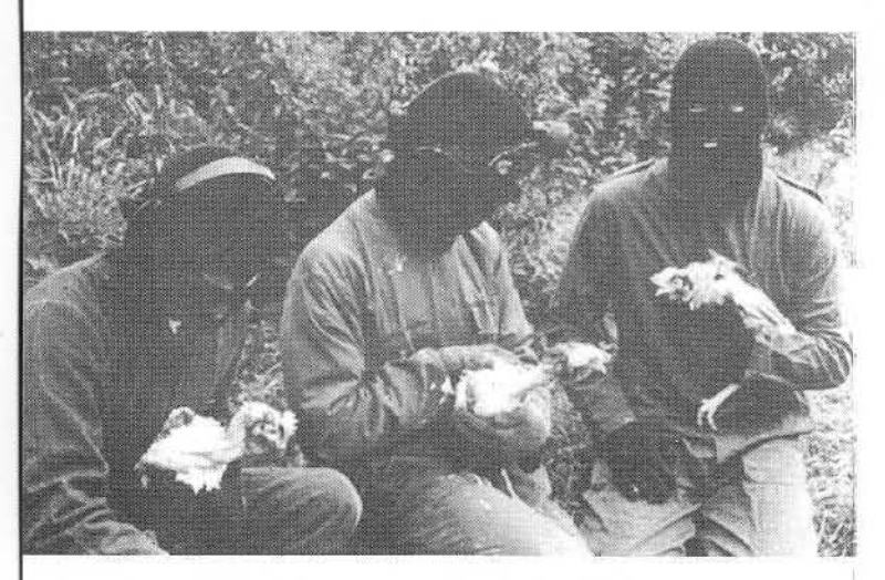
THIS IS ILLEGAL

Since its formation the Animal Liberation Front has saved many thousands of animals from death and suffering. Its actions have also played an important part in the closing down of many animal abuse establishments through the tactic of economic sabotage.